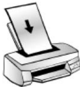
Top Feed Printer