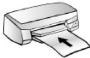
Front Feed Printer